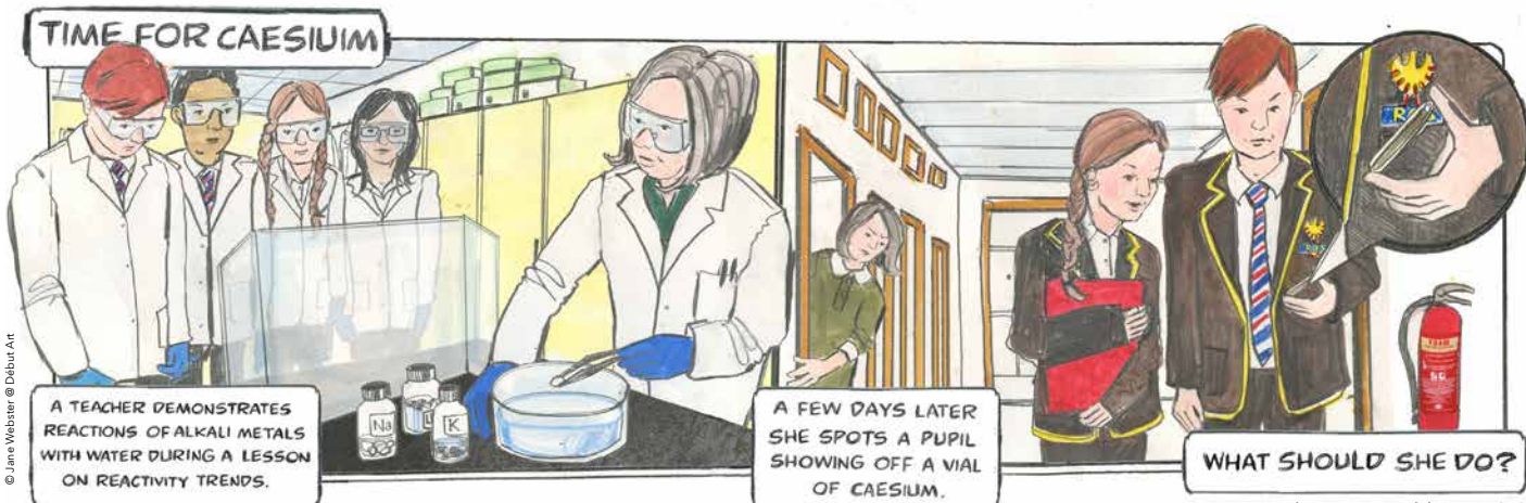
© Jane Webster @ Dibut Art